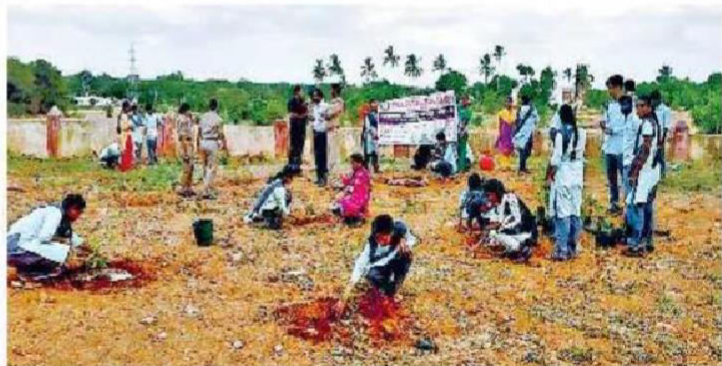
మొక్కలు నాటుతున్న విద్యార్థులు

బాధ్యతగా ఒక మొక్కను నాటి పెద్ద చేయాలని ఆయన సూచించారు. విద్యార్థులు, అధ్యాపకులతో పాటు పట్టణ మహిళా పోలీసు స్టేషన్ పోలీసులు కూడా కార్యక్రమంలో పాల్గొన్నారు.