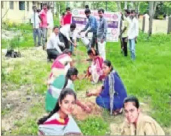
మొక్కలు నాటుతున్న వలంటీర్లు