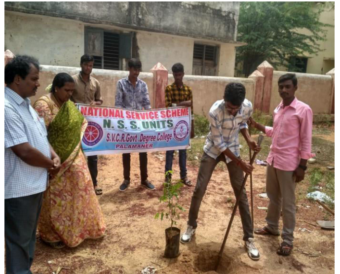
MISSION ANDHRA PRADESH